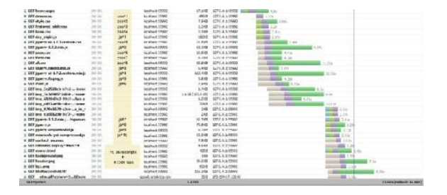
Fig. 2. Before applying any recommendations

The above mentioned recommendations were applied in developing the case study system and the study shows the following.